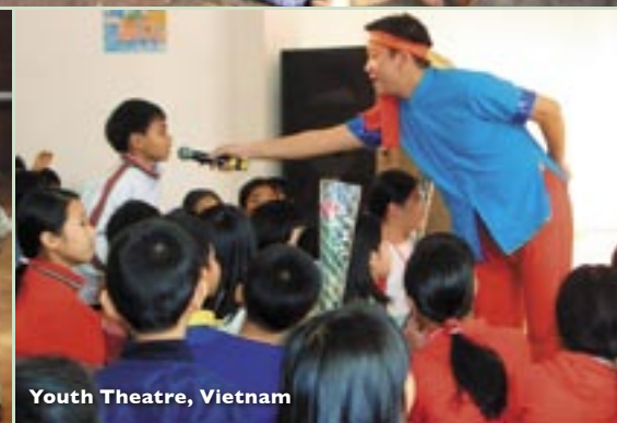
Youth Theatre, Vietnam