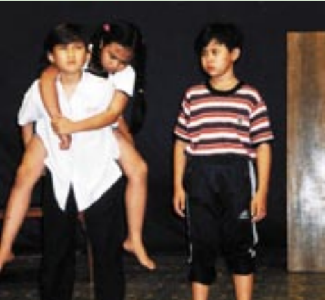
Rehearsal with a group of children, HCMC Drama Theatre, Vietnam