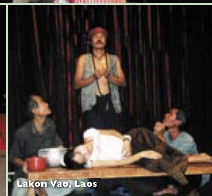
Lakon Vao, Laos