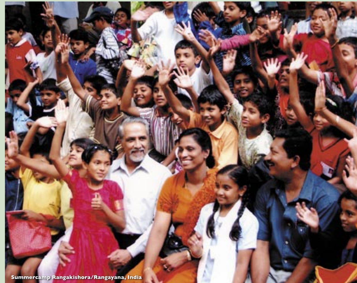
Summercamp Rangakishora/Rangayana, India