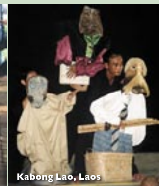
Kabong Lao, Laos