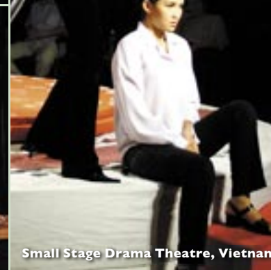
Small Stage Drama Theatre, Vietnam