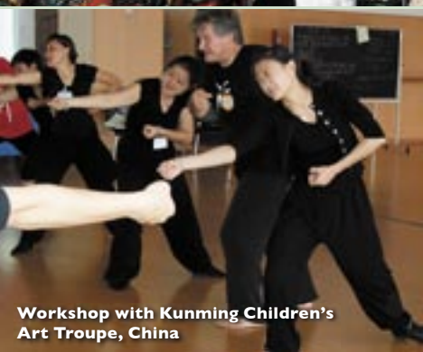
Workshop with Kunming Children's Art Troupe, China