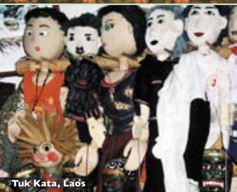
Tuk Kata, Laos