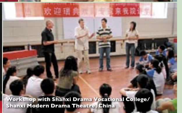
Workshop with Shanxi Drama Vocational College/ Shanxi Modern Drama Theatre, China