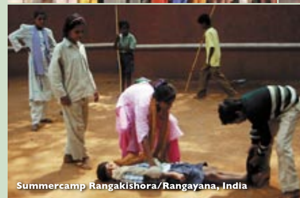
Summercamp Rangakishora/Rangayana, India