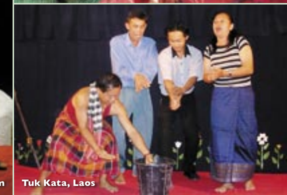
Tuk Kata, Laos