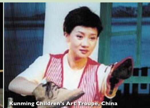
Kunming Children's Art Troupe, China