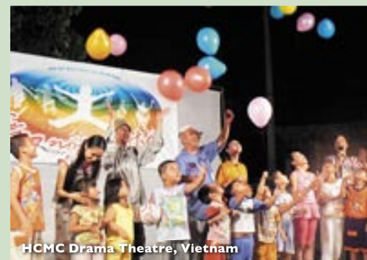
HCMC Drama Theatre, Vietnam

The Small Stage Drama Theatre is based in HCMC that commenced its experimental activities on a small scale in 1984, but has existed in its present independent form since 1997. Characteristic of the group is its serious artistic emphasis with an aspiration to be "genuine" with a repertoire of quality theatre for adults. A spatially flexible form of performance without proscenium stage or microphones and loudspeakers is unusual within contemporary spoken drama theatre in Vietnam. Within Children's Voice, the Small Stage Drama Theatre has started activities outside its adult theatre emphasising social engagement and reaches out to the particularly vulnerable metropolitan region youth audience.